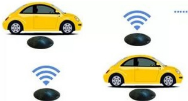
Fig. 4. Sensor installation

The creation of an application for monitoring available parking spaces using sensors involves several stages (Alsaawy et al., 2022). First, it is necessary to determine the type of sensors, such as motion sensors, ultrasonic sensors, or cameras. Then, these sensors need to be installed at the parking spaces, which may require agreements with car park owners or municipal authorities. Next, the sensors are configured to transmit information about the status of parking spaces (occupied/vacant) to a server. After that, a server or cloud platform needs to be developed to receive data from the sensors.