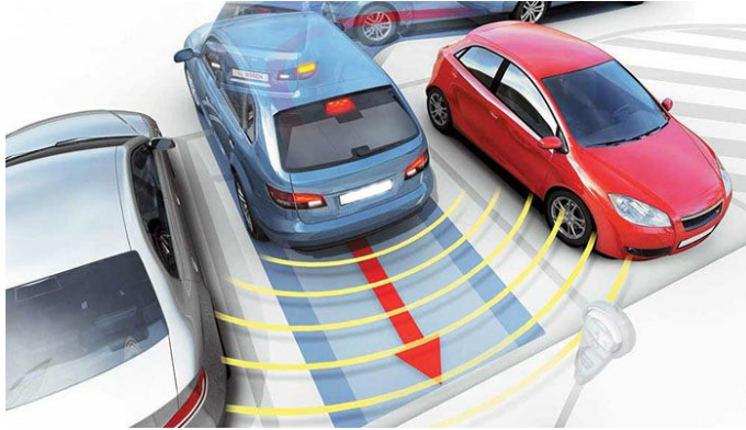
Fig. 3. Parking process

allow determining in the shortest possible time the availability of free parking spaces and building the necessary route (Fig. 3).